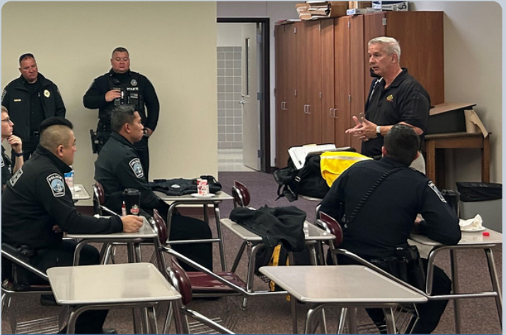
Police briefing at Ambridge High School Active Shooter review & exercise on 10/28/22