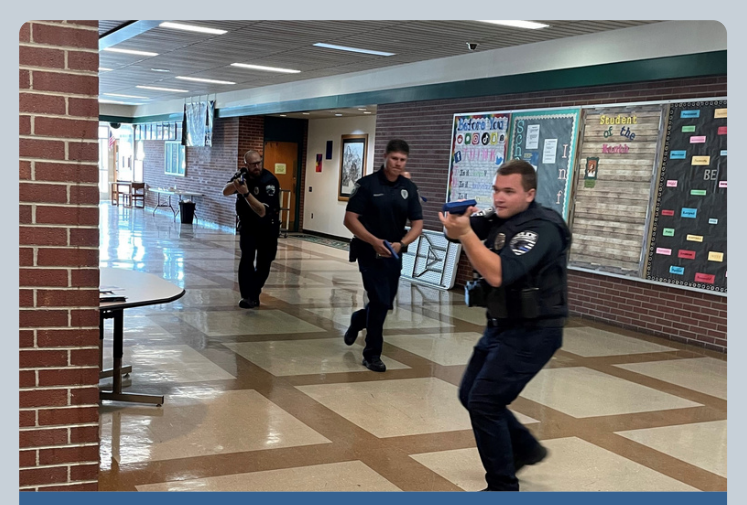
Riverside Active Shooter and Stop the Bleed Training, 10/10/22

RAIDER (Rapid Deployment) Training on 08/18/22 For Law Enforcement in Active Shooter Incidents Presented by local LE instructors at Rochester High School